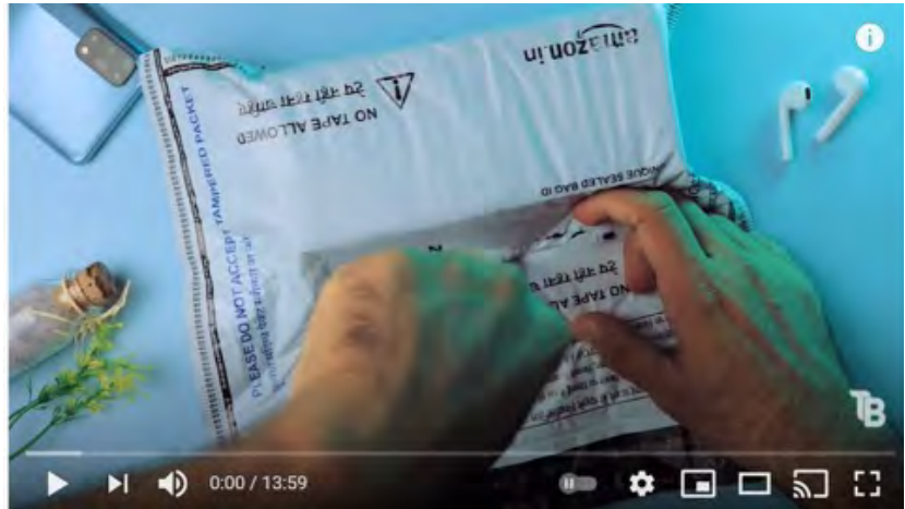
Amazon unboxing video published to YouTube on September 19, 2020 (note the Amazon.in logo on the top right).

In late November 2021, news accounts reported 74 that Amazon had pledged to cut its use of plastic packaging in Germany by the end of the year. Germany is one of the company's largest markets – the company has a reported 53% market share in the country and ships hundreds of millions of packages in Germany annually. 75 Amazon, in an operational note it shared with Oceana, 76 said it will switch from plastic to delivering in “flexible paper-based bags” and other plastic alternatives and said this switch will apply to items shipped by Amazon and those shipped by third-party providers through Amazon. Amazon's pledge to move away from single-use packaging in one of its largest markets shows it is possible to do this everywhere it operates around the world.