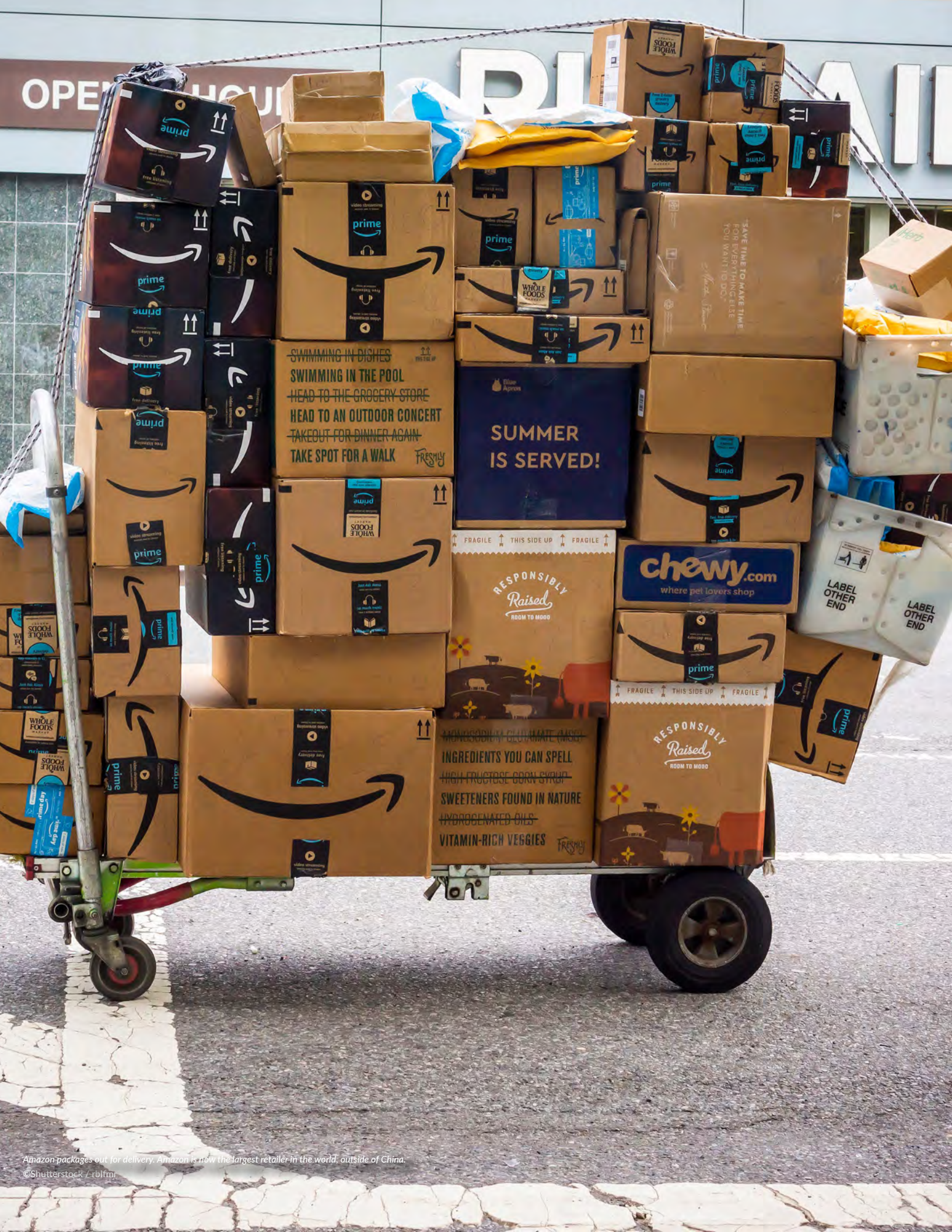
Amazon-packages out for delivery. Amazon is now the largest retailer in the world, outside of China.