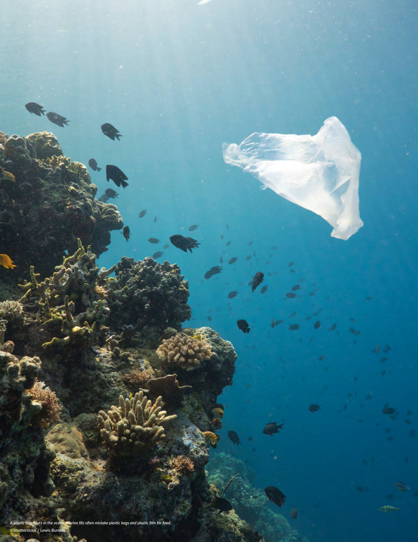
A plastic bag floats in the ocean. Marine life often mistake plastic bags and plastic film for food.