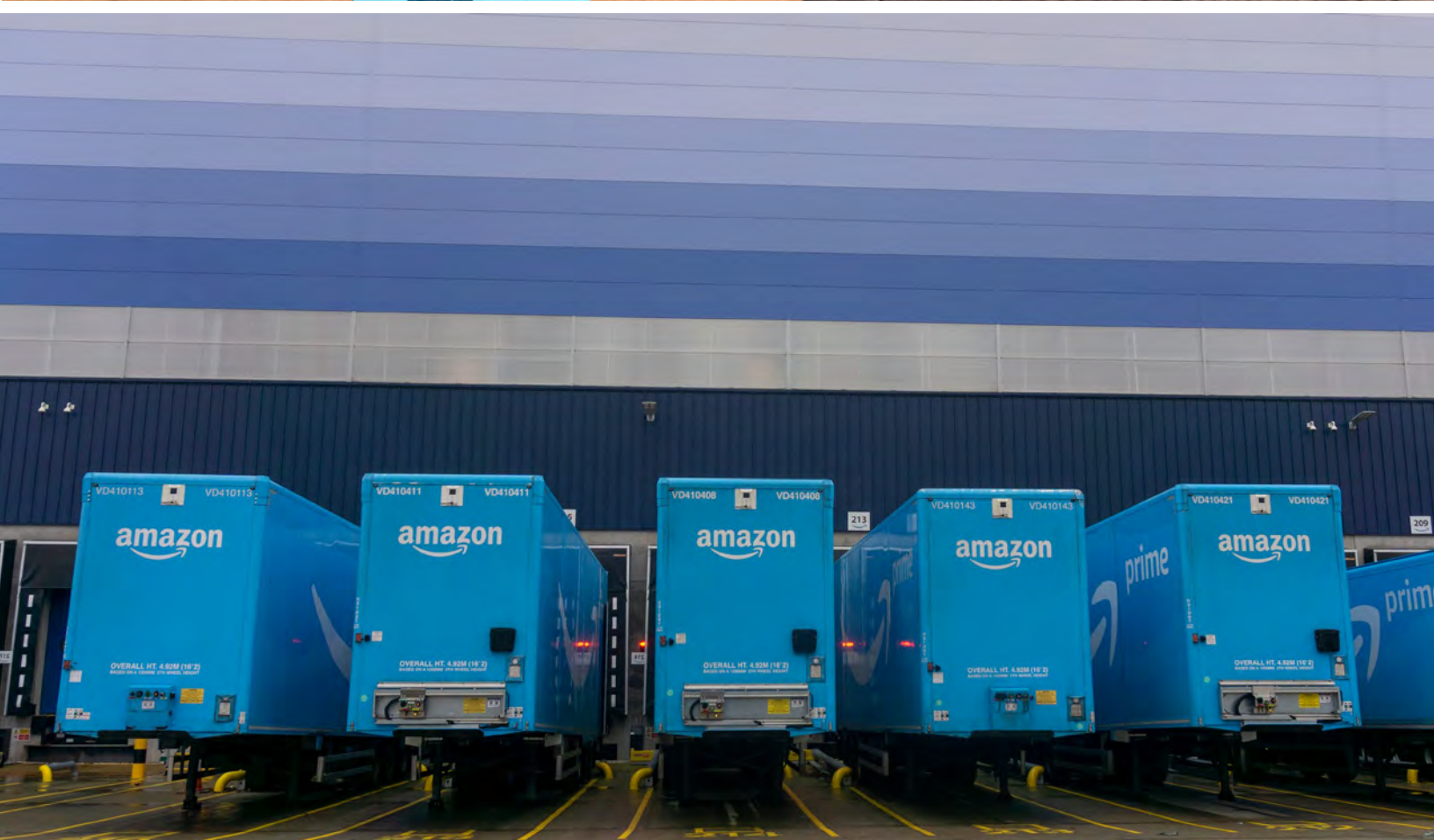
Amazon shipping trucks.