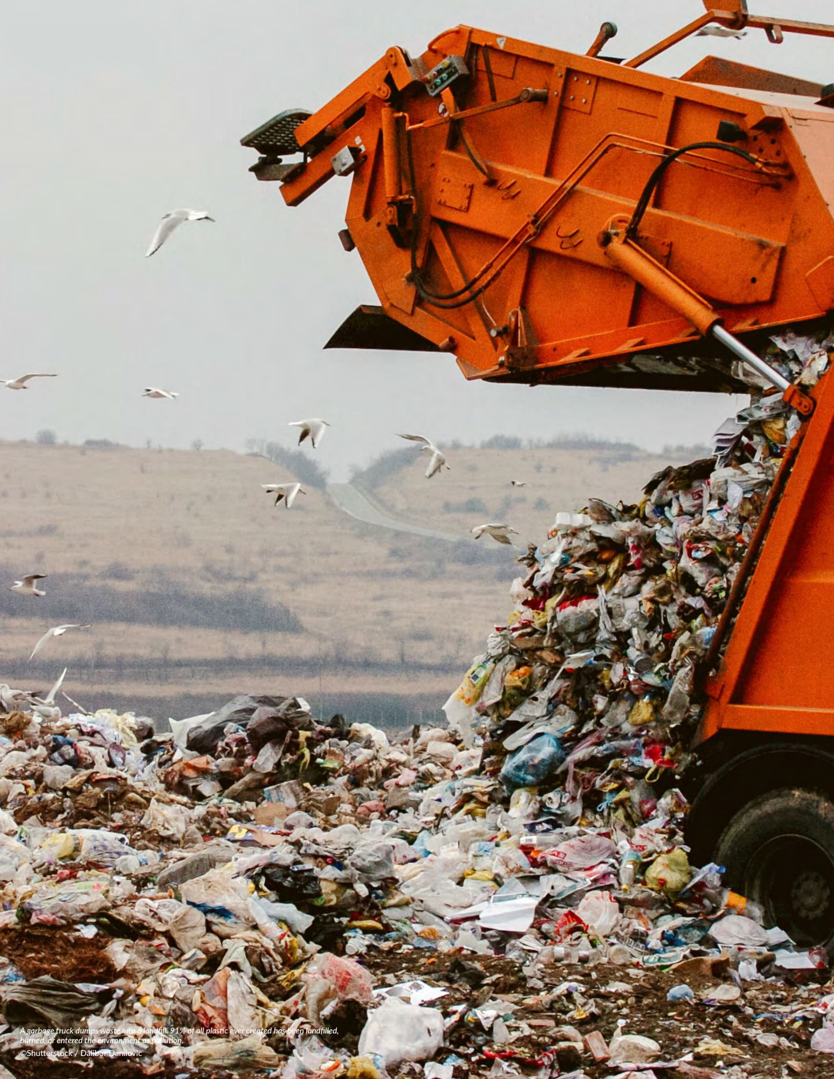
A garbage truck dumps waste into a landfill. 91% of all plastic ever created has been landfilled, burned, or entered the environment as pollution.