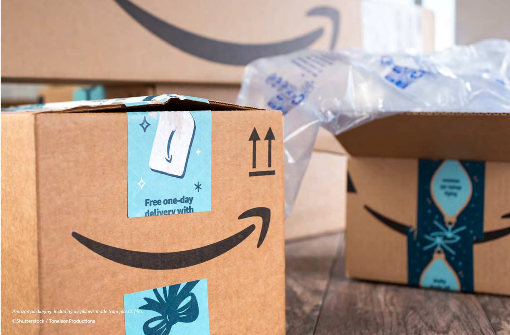
Amazon packaging, including air pillows made from plastic film.