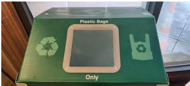
Plastic bag bin in store linked to by Amazon for disposal of Amazon plastic packaging, taken by a mystery shopper.

The secret shoppers, hired by Oceana, who visited stores listed as participating in the plastic film recycling program used by Amazon reported that 41% of the stores visited would not accept Amazon plastic packaging and more than 80% of store managers were not familiar or did not know that Amazon was directing its customers to put plastic packaging in the plastic bag bins and were not certain how or what company took it away. The store managers who rejected Amazon plastic packaging made the following statements to the secret shoppers: