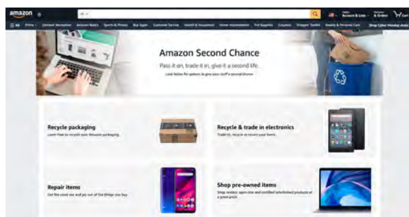
Amazon Second Chance web page.

Amazon's plastic packaging is – as previously noted – a type of plastic known as plastic film –the “plastic shopping bag” category of plastic. Amazon writes on its sustainability website and report, that plastic film “Is a difficult material to process, and most municipal recycling programs do not accept it.” 64