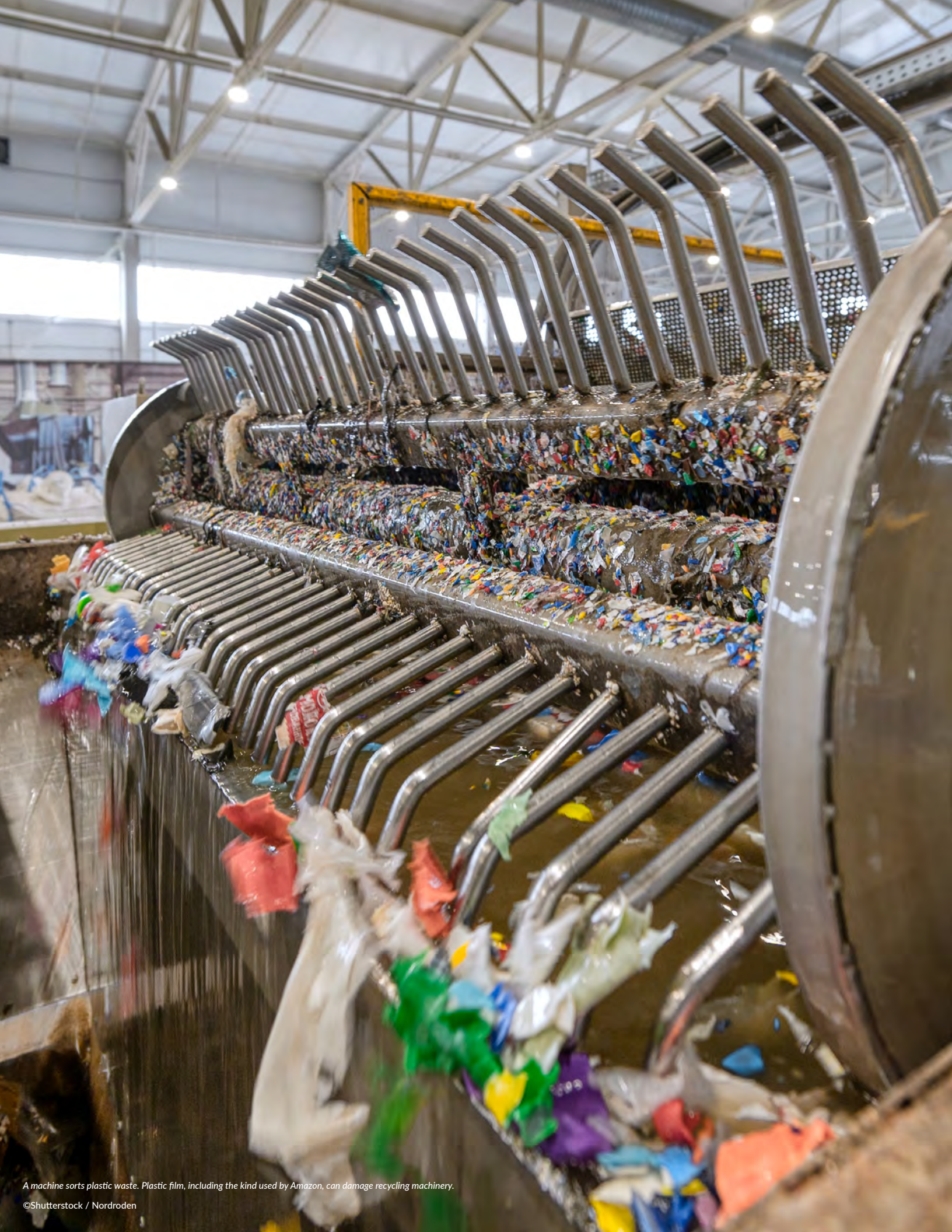
A machine sorts plastic waste. Plastic film, including the kind used by Amazon, can damage recycling machinery.